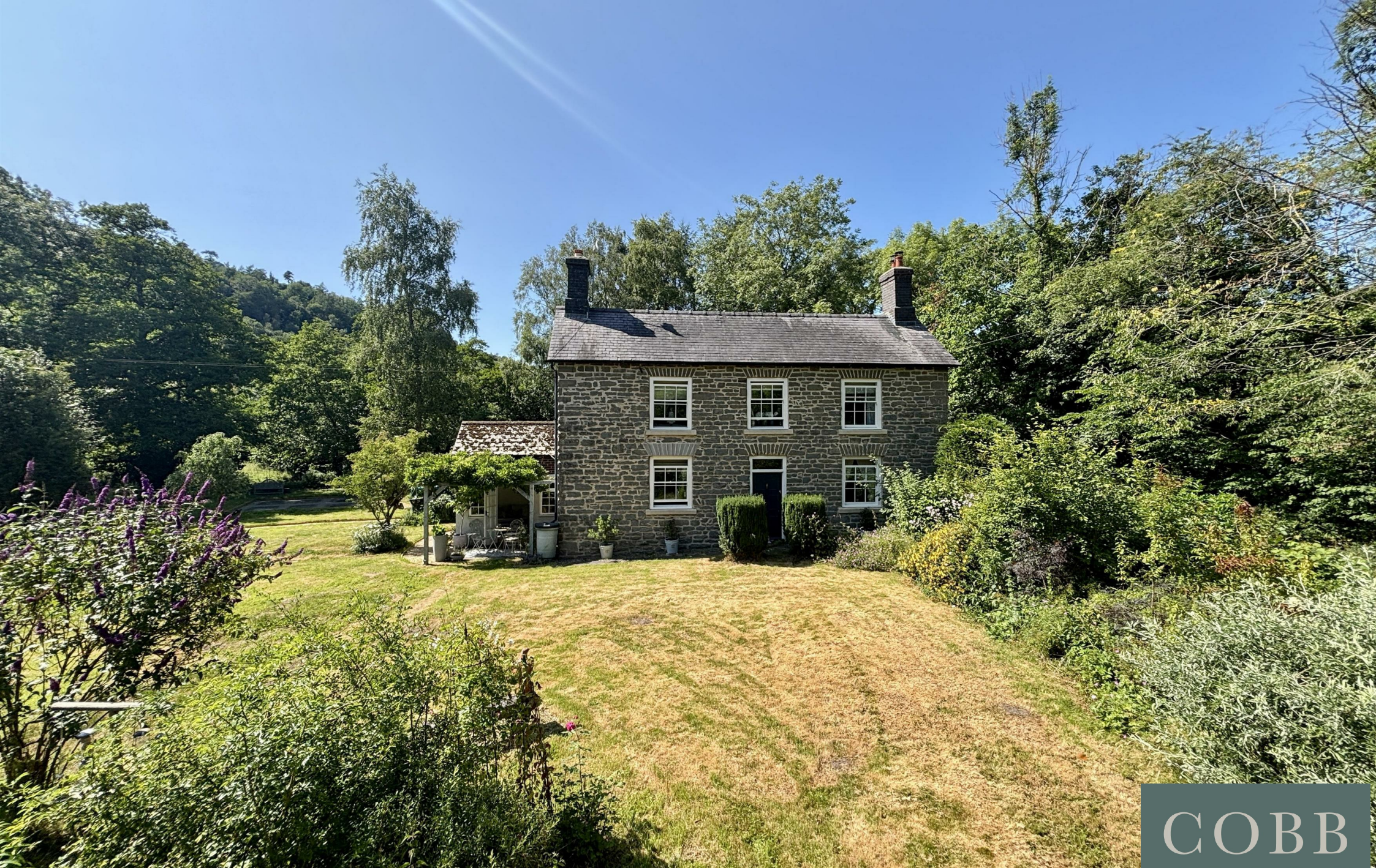
Hudson House, Mardu Lane, Clun, SY7 8QF Price £550,000